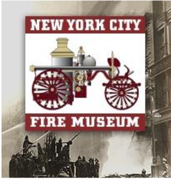
OFFICIAL MUSEUM OF THE FDNY

Times Square, Empire State Building, Central Park, etc.